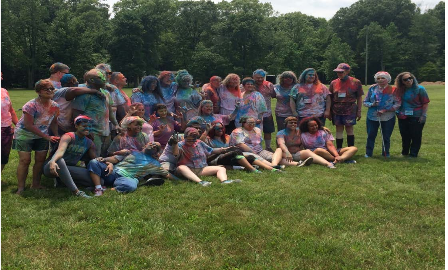
Deaf-Blind Campers Pose After Holi Celebration Activity