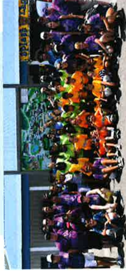
BEECH BEND PARK